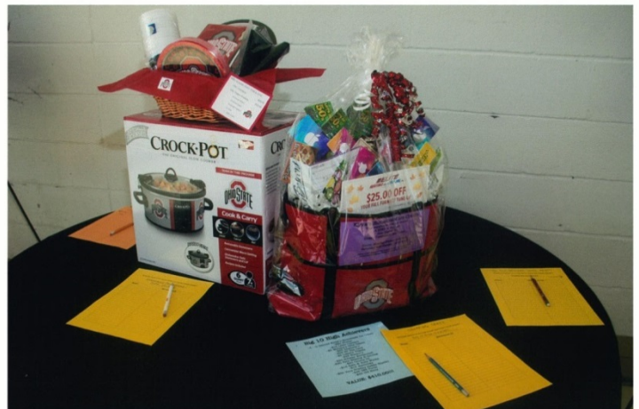
Each participating club received $150.53 for their Silent Auction Items.

**For a copy of a detailed 4-H Council Budget, please contact the Extension Office.