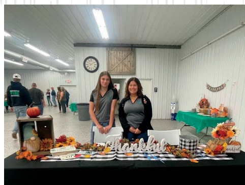
Teen Ambassadors welcoming guests.