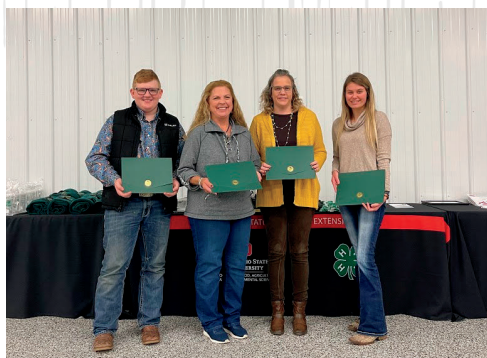
Clubs of Distinction Bethesda Buckeyes, BPHH, High Meadows, Stallions