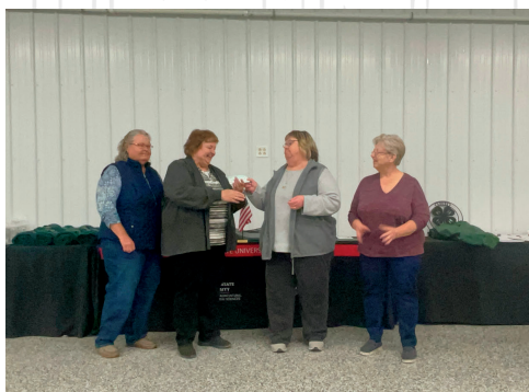
Belmont County Reverse Raffle Committee members presenting a check from the fundraiser to Belmont County 4-H Council.