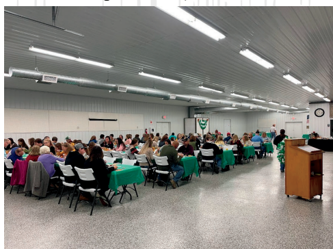
Attendees of the recognition brunch.