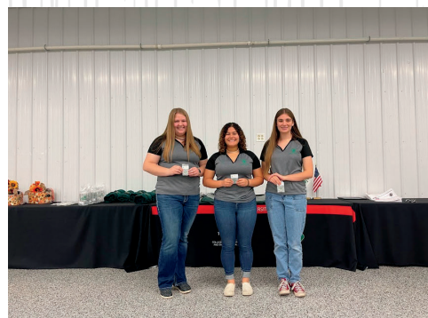
Teen Ambassadors Token Of Appreciation