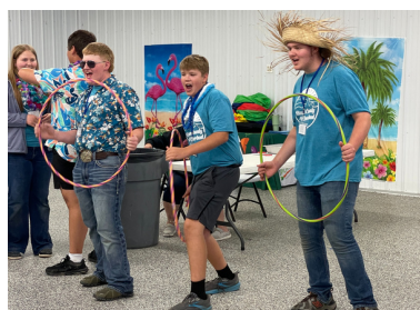
Cloverbud Camp 2023